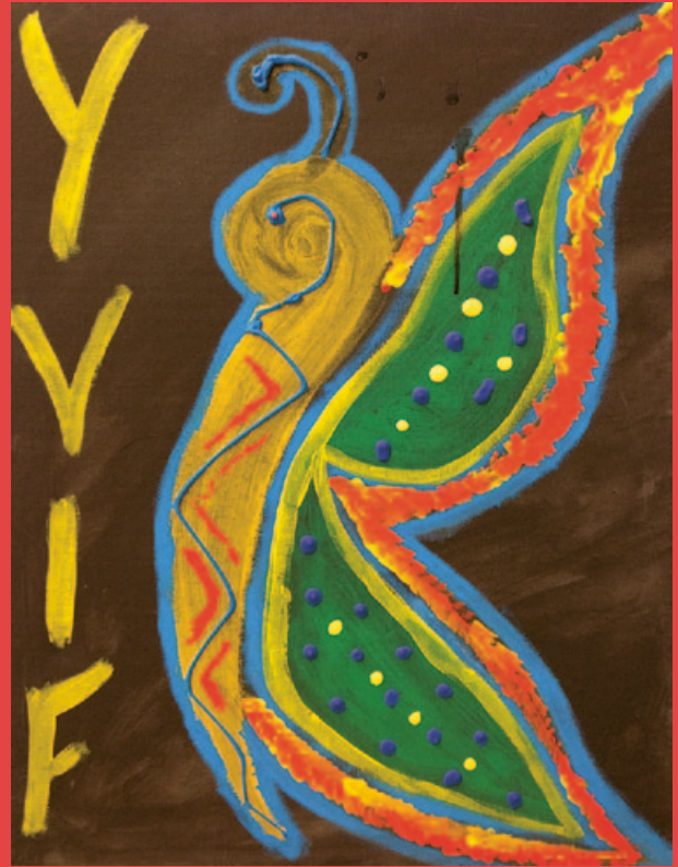
Your Voice is Free theatre project