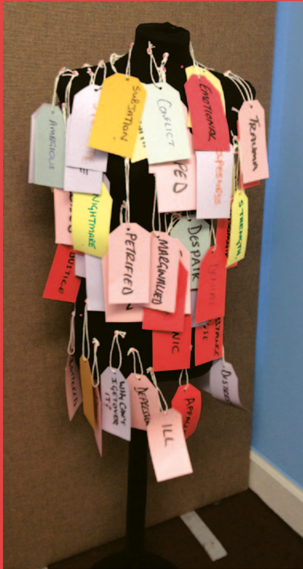
Art group project for International Women's Day