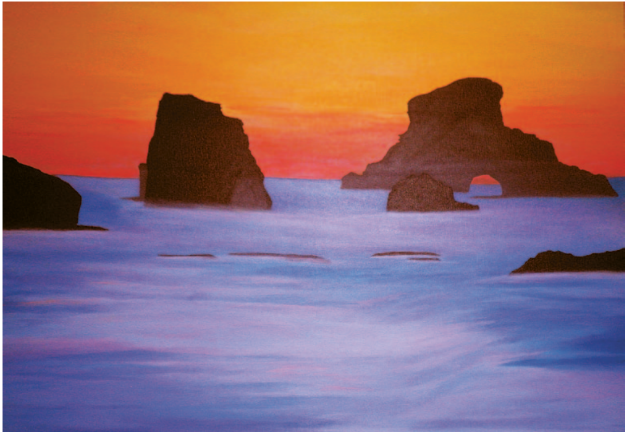
'Sea Dream' by Aileen Carruthers www.aileencarruthersart.co.uk

wherever they can. They can direct you to life buoys you never knew existed, connect you to lines all around you that you'd never have seen for the waves if someone hadn't taken the time to show them to you. When you let people help you, when you take that calculated risk of raising your hand to attract attention, not only do you help yourself, but you reenforce those lifesaving services, you reestablish a world in which people care for each other. You counteract directly the work of the rapist – and not just for your benefit, but that of everyone.